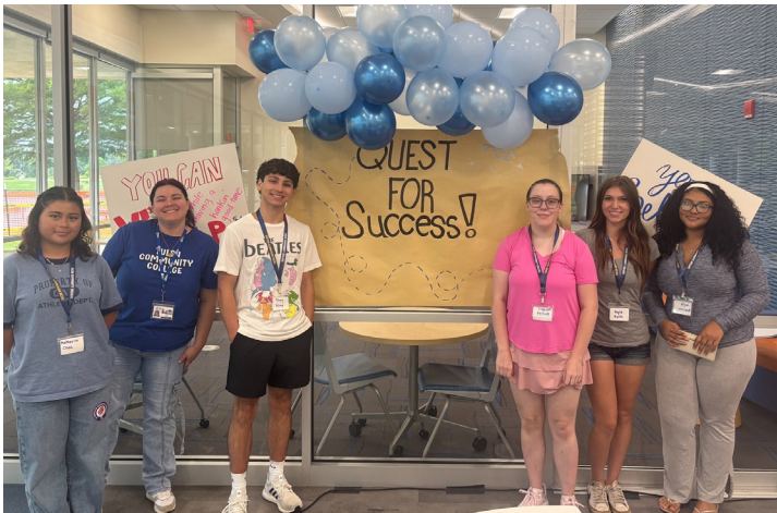
Prospective TCC students participate in the Native-American Serving Non-Tribal Institutions (NASNTI) Summer Bridge Program, which helps incoming freshmen close curricular gaps before the fall semester begins.