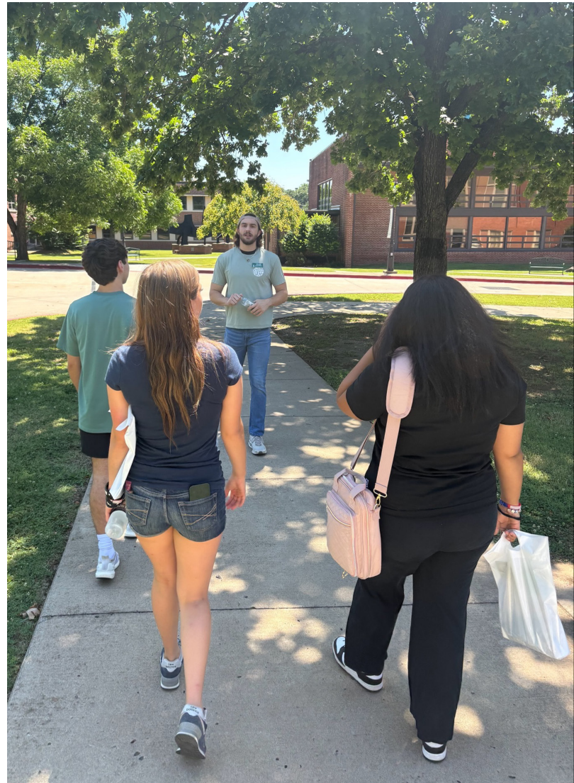
Prospective TCC students participate in the NASNTI Summer Bridge Program.