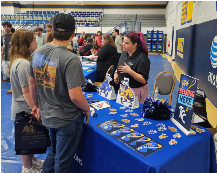
NASNTI project staff engage with students about TCC at the Northeastern Oklahoma A&M College Fair.

TCC’s funding under the Title III Native American-Serving Non-Tribal Institutions (NASNTI) Cooperative grant (led by Northeastern State University) helped launch the Help Hub, a one-stop resource center offering student support with admissions, financial literacy, and technology tools. 1