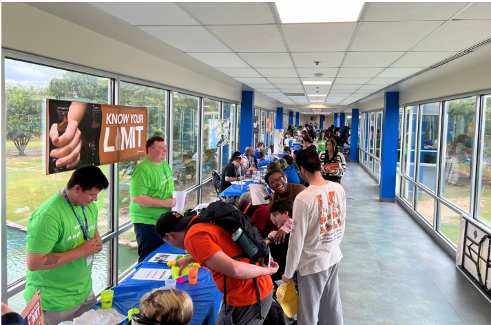
TCC students visit interactive booths on Fresh Check Day, an annual mental health promotion event coordinated by Mental Health Awareness Training (MHAT) staff.